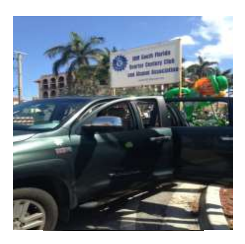
St Pat's IBMSFQCCAA Truck