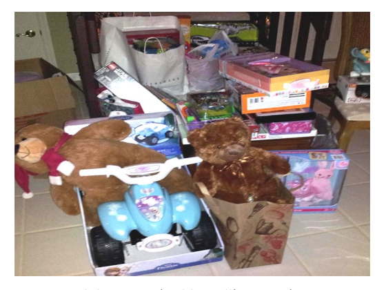
<u>Holiday Party (Debbi Dell's House) –</u> <u>December 2014</u>—Toys for Tots Gifts