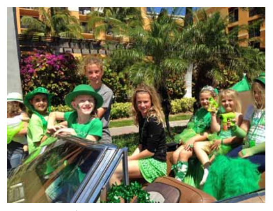
St. Patrick's Day Parade—McCarthy Clan