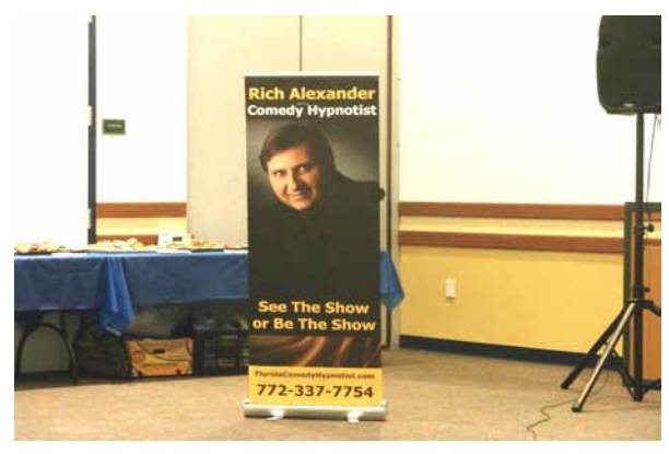
IBMSFQCCAA Annual Meeting - December 2014—Hypnotist