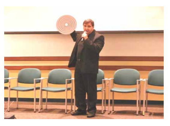
IBMSFQCCAA Annual Meeting – December 2014—Hypnotist