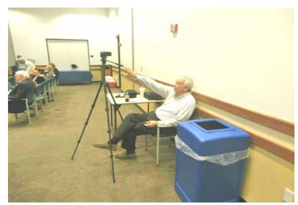
IBMSFQCCAA Annual Meeting – December 2014—Hypnotist