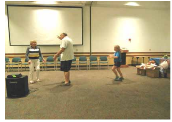
IBMSFQCCAA Annual Meeting – December 2014—Hypnotist